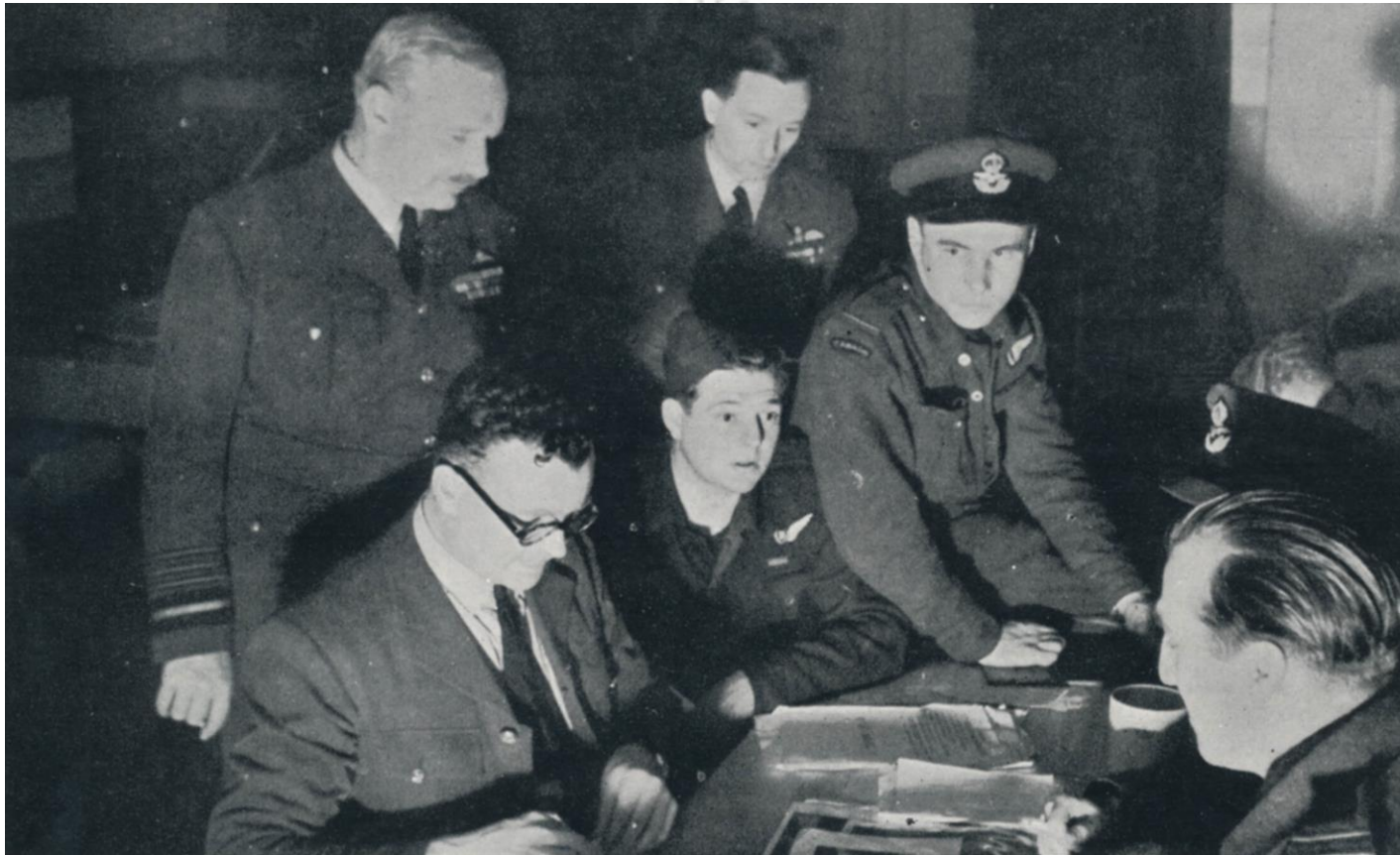
RAF 617 Sqn. debrief following 'Dambusters' Raid (rear left) AC-M Sir Arthur 'Bomber' Harris Chief of Bomber Command.